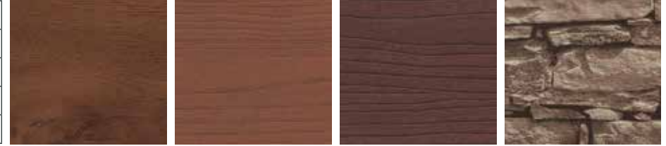
Examples of various decorative laminates